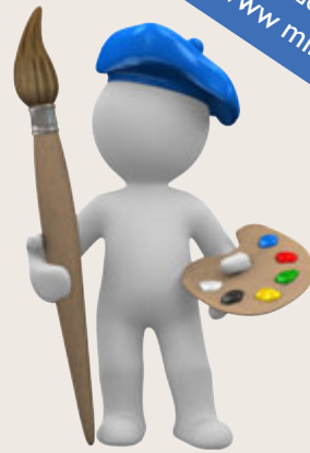
Image correction from InDesign/Quark layout